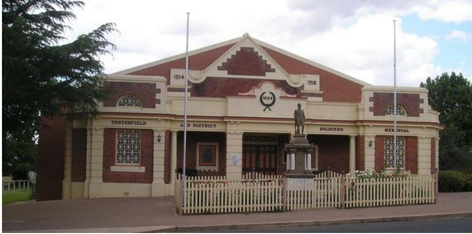
Tenterfield and Districts Fallen Soldiers Roll of Honour