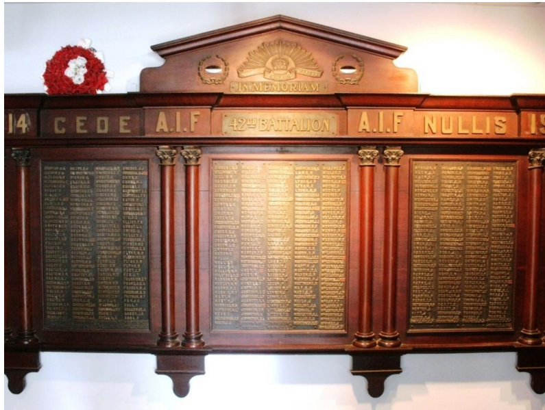
42 nd Infantry Battalion Roll of Honour